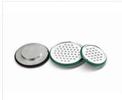
Specimen discs with cubic studs enable stable specimen mounting

The flat stem provides large contact surface for heat transfer and the ease of operation