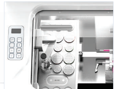
Easily adjust crucial parameters and move specimen via physical control panel

The flat stem provides large contact surface for heat transfer and the ease of operation